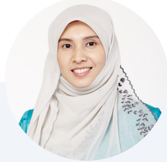
The Honourable Nurul Izzah Anwar Member of Parliament Malaysia