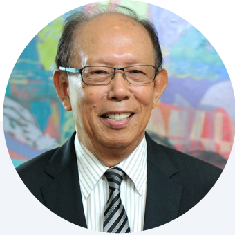
The Hon. Tun Musa Hitam Chairman of WIEF Foundation and Former Deputy Prime Minister of Malaysia

Tun Musa Hitam, who is currently Chairman of the World Islamic Economic Forum (WIEF) Foundation was Malaysia's Deputy Prime Minister until 1986. In the course of his service in the Malaysian government, he held various positions including Minister of Home Affairs, Education, Primary Industries and Trade and Industries and Chairman of the Federal Land Development Authority (FELDA). Among his major official activities were as Leader of Malaysian Investment Missions to Europe, United States and Japan, Leader of the Commonwealth Observers Delegation to the Malawi and Pakistan general elections and Member of the Commonwealth Ministers Action Group Delegations to Nigeria, Fiji and the Gambia. He also represented Malaysia at UN, UNESCO and United Nations Economic and Social Council (ECOSOC) related negotiation and regular conferences. He was also elected for one term Chairman of the UN Commission on Human Rights.